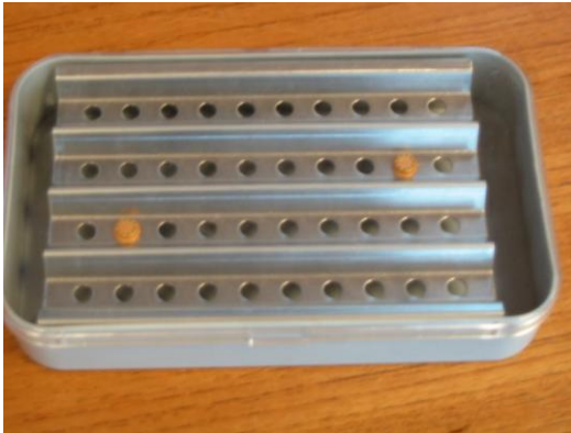
XEN-80020: Box for storage and manipulation of TO-5 packages