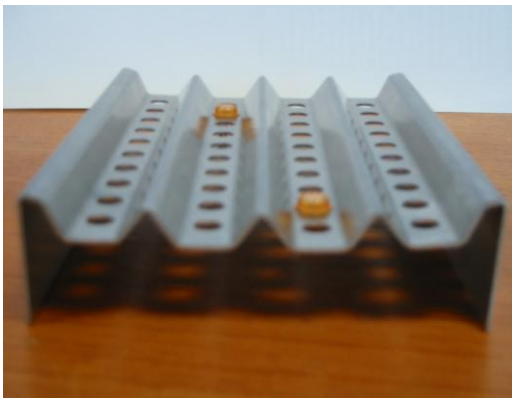
Box interior with 40 positions