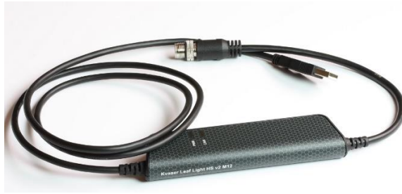
XEN-84202: Kvaser CAN-USB interface with M12-T-piece