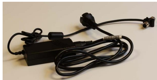
XEN-84201: CAN bus Power supply 12V with M12-T-piece