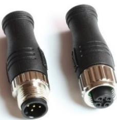
XEN-84200: Terminator set 120 Ohm male M12 - female M12 connectors