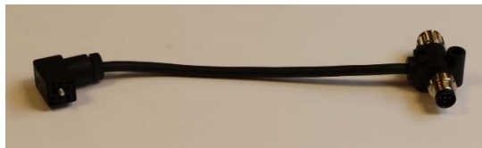
XEN-84002: Cable M12-T for CAN HP housing