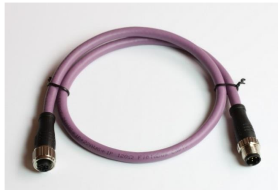
XEN-84005: Cable 0.5 m male M12 - female M12 connectors Other cables similar, but longer.